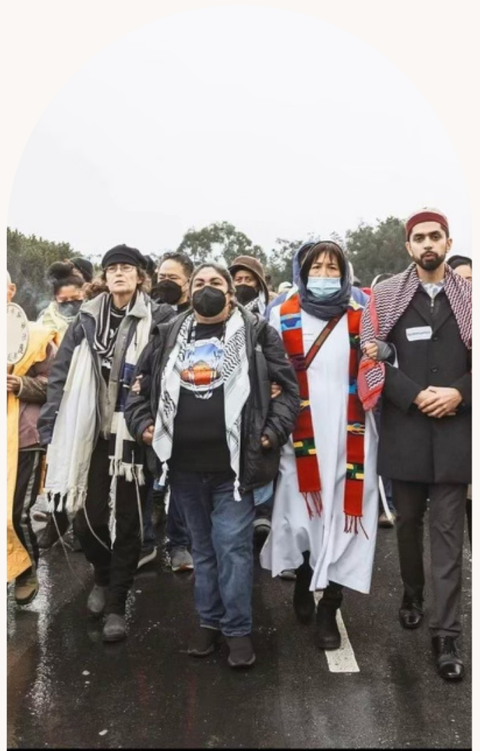
Rabbi Cat and other interfaith leaders march for permanent ceasefire Dec 2023